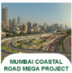
MUMBAI COASTAL ROAD MEGA PROJECT