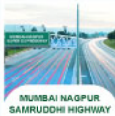
MUMBAI NAGPUR SAMRUDDHI HIGHWAY