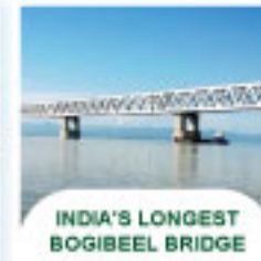
INDIA'S LONGEST BOGIBEEL BRIDGE