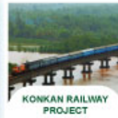
KONKAN RAILWAY PROJECT