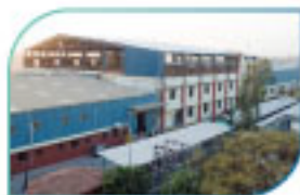
RAKHOLI DADRA AND NAGAR HAVELI