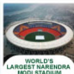
WORLD'S LARGEST NARENDRA MODI STADIUM