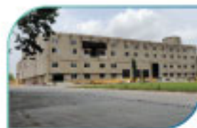
CHINCHPADA DADRA AND NAGAR HAVELI