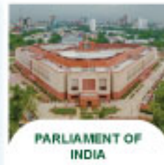
PARLIAMENT OF INDIA