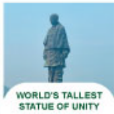
WORLD'S TALLEST STATUE OF UNITY