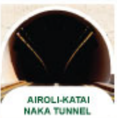
AIROLI-KATAI NAKA TUNNEL