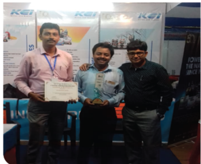
9th Bhutan Construction Expo at Thimphu, Bhutan. 27th – 30th July, 2018.