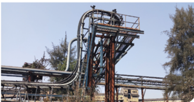
NALCO (National Aluminum Company Limited) Project- entire installation of cables on specially designed, tested and approved steel structures installed by KEI.