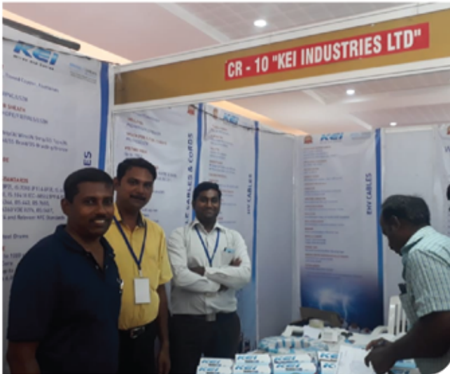
Participation in CONSTRO MEGA – 2018 (27th July- 30th July) Exhibition conducted by Tirupur Civil Engineers Association.