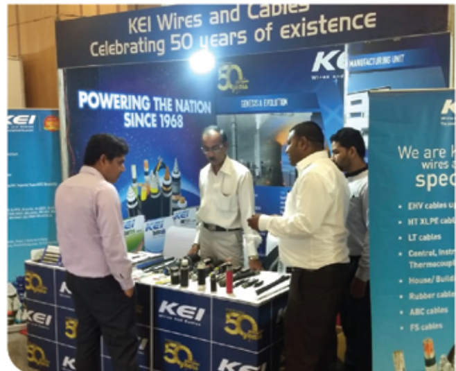
Participation in Raipur exhibition organized by BIS & Indian Buildings Congress on 13th - 14th July, 2018.