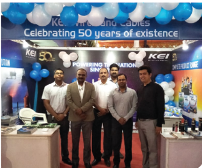
Participation in ECAM Expo 2018, organized on the 7th and 8th Sept in Pune.