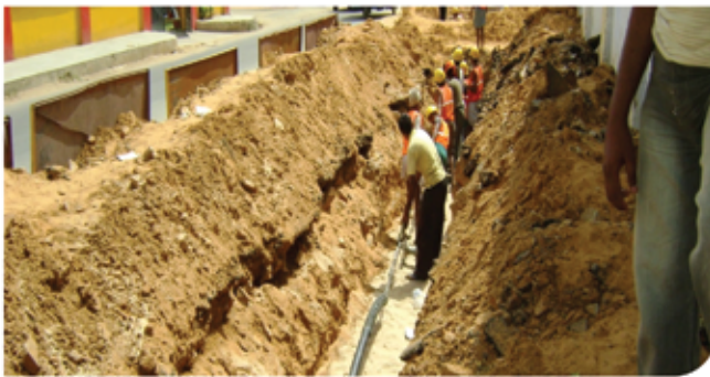
Delhi Metro Railway Corporation- Entire underground cabling done by KEI.

ELECTRIFYING INDIA: We believe that every business has a major role to play in nation-building and KEI has been a critical contributor in this process. Some of the key projects handled by us are: