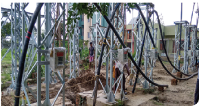
KEI carried out the entire underground cabling on Farakka River Bridge.