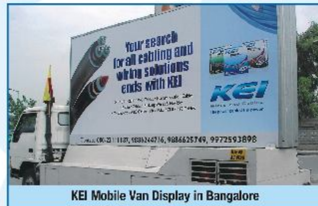
KEI Mobile Van Display in Bangalore