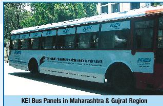
KEI Bus Panels in Maharashtra & Gujrat Region