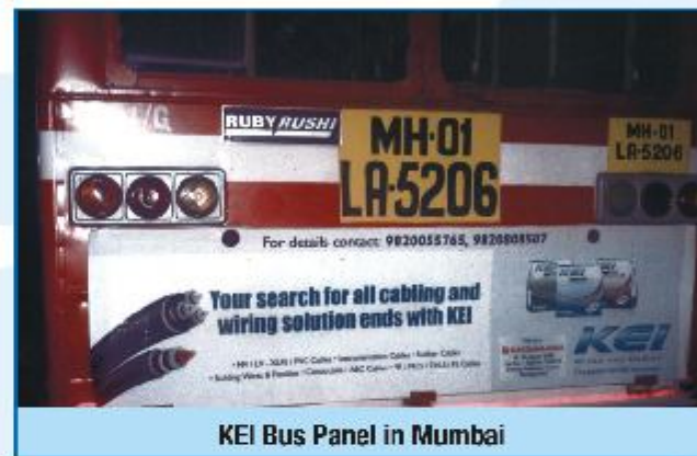
KEI Bus Panel in Mumbai