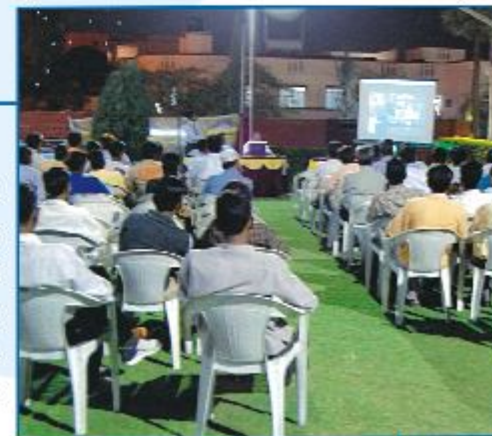
Uniting Electricians in Udaipur and Panipat

In order to keep the interest of the electrician's community alive in KEI's range of Housewires and Flexibles products, KEI did an Electrician Meet at Udaipur and Panipat with more than 200 participants attending the meet. KEI also showcased its entire range of Housewires and Flexibles products during this meet. KEI is planning to conduct such meets in other parts of Northern and Western regions as well.